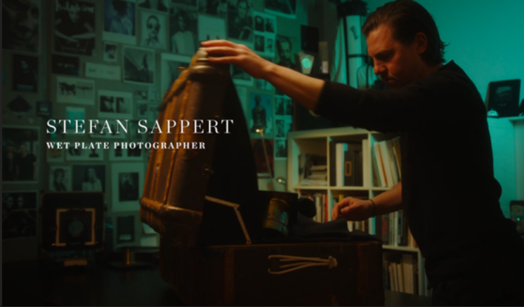
STEFAN SAPPERT WET PLATE PHOTOGRAPHER