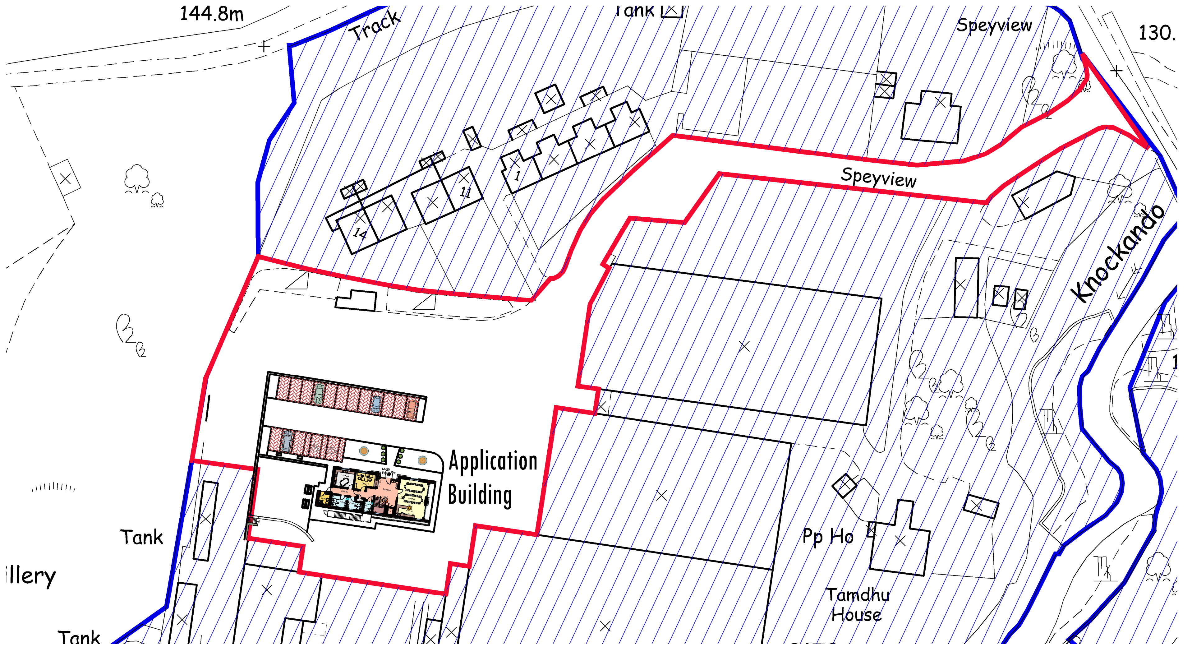
Proposed Part Site Plan Scale 1:500 @ A1

Crown copyright and database right. All rights reserved. Ordnance Survey licence no 100049616