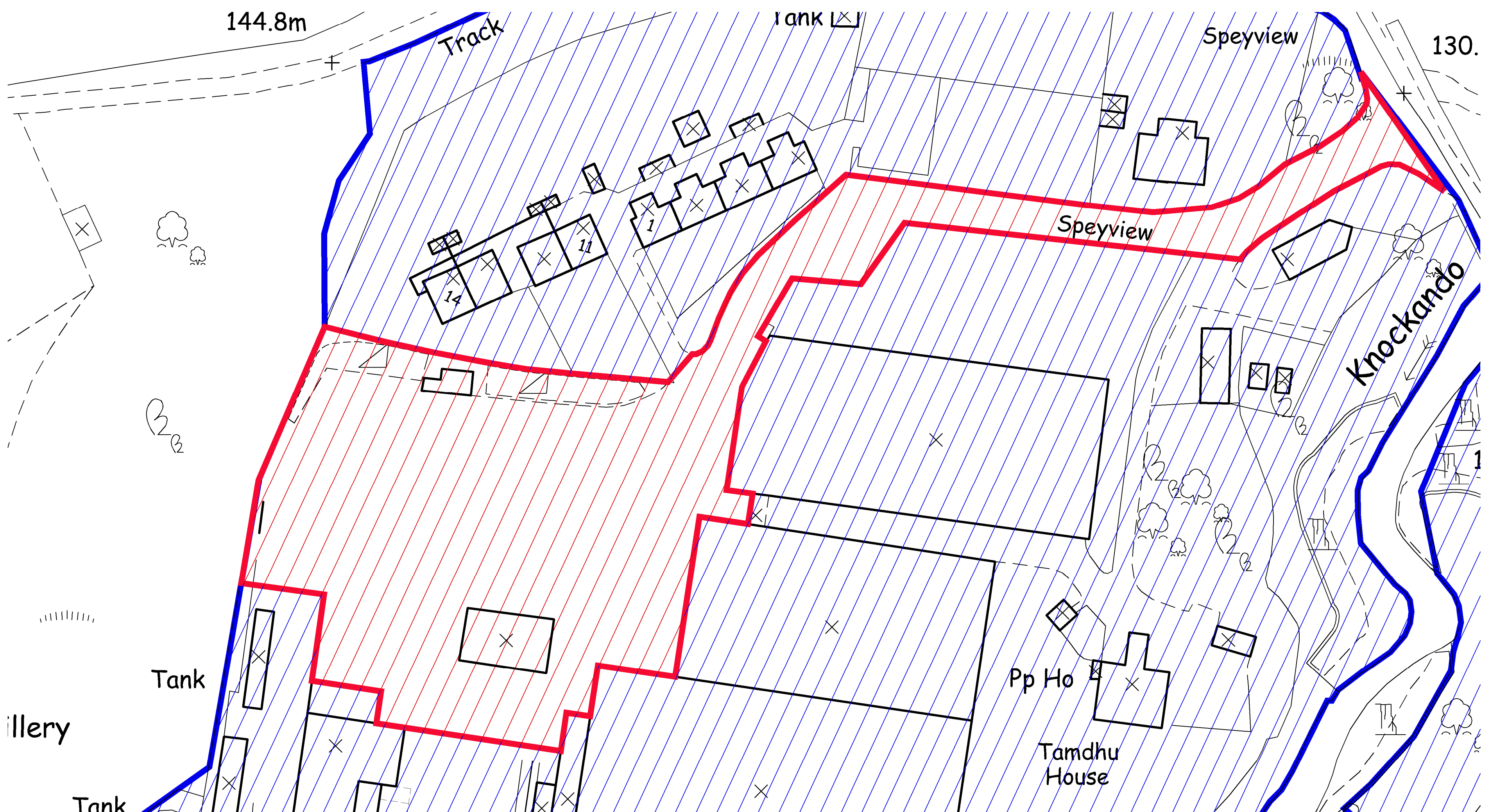
Existing Part Site Plan Scale 1:500 @ A1

Crown copyright and database right. All rights reserved. Ordnance Survey licence no 100049616