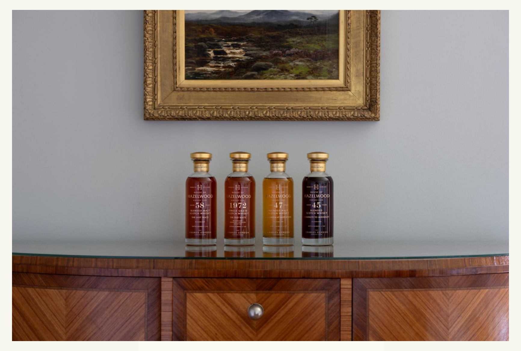
CHARLES GORDON COLLECTION