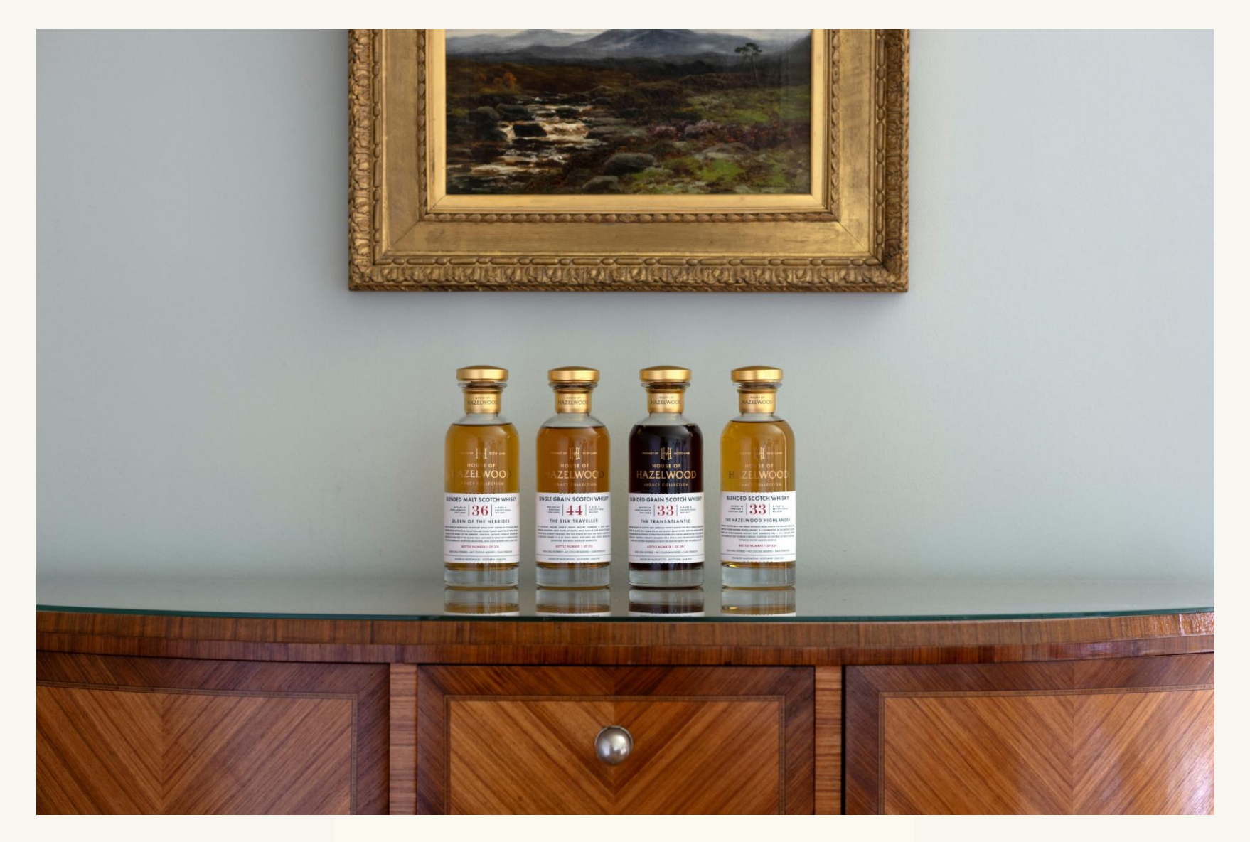
THE LEGACY COLLECTION